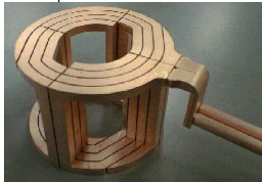
Figure 2: "Sakae coil".

The manufacturing process of the coil is described roughly as follow [3]. First, grooves and through holes is formed into a cylindrical oxygen-free copper block. Secondly, the grooves and through holes are filled with wax. Thirdly, the surface of the wax is coated with silver powder to give electrical conductivity. After that, the surface coated with silver powder is PR electroformed building up a lid of the grooves. Then, hollow structure is obtained when the wax is removed by heating. Finally, the holes in which magnetic poles are inserted are formed by cutting out unnecessary parts of the block, and then the coil is completed.